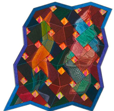
Same Difference (2009)