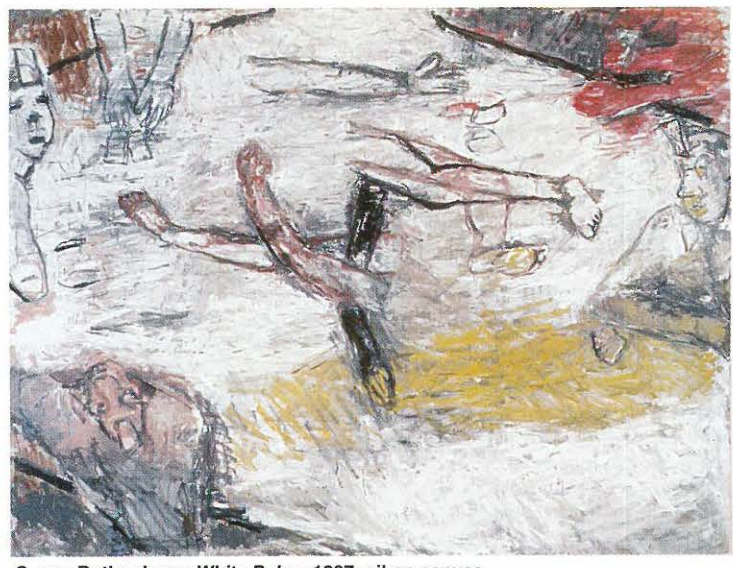
Susan Rothenberg: White Poker, 1997, oil on canvas, 87 by 113 inches; at Sperone Westwater.

The addition of the heads introduces a narrative component into Rothenberg's work. Similarly, the emphasis on poker suggests allegorical possibilities. In the poker paintings, disembodied heads and hands, viewed from above, hover over tables scattered with spread-out hands of cards. In one of these works, the center of the table is piled with loose arms and legs, while the player's heads and hands are relegated to the edges of the canvas. In others, heads bend intently over the flat plane of the table as if they have become the gaming elements. Is Rothenberg making a statement about the unavoidability of chance? Or is she just showing how one spends quiet