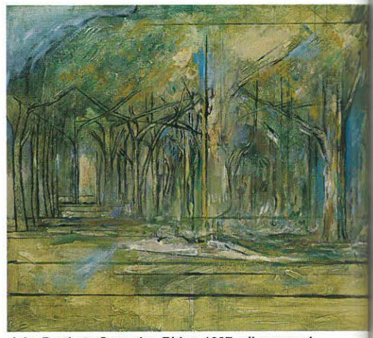
Jake Berthot: Cummins Ridge , 1997, oil on wood panel, 18 by 23% inches; at McKee.

Primarily a painter, Feeley favored canvases in which simple geometric forms are deployed singly or in repeating groups. He used upright barbell or baluster shapes, oblongs that resemble peanuts, small solid-looking arches and wavy-contoured squares and