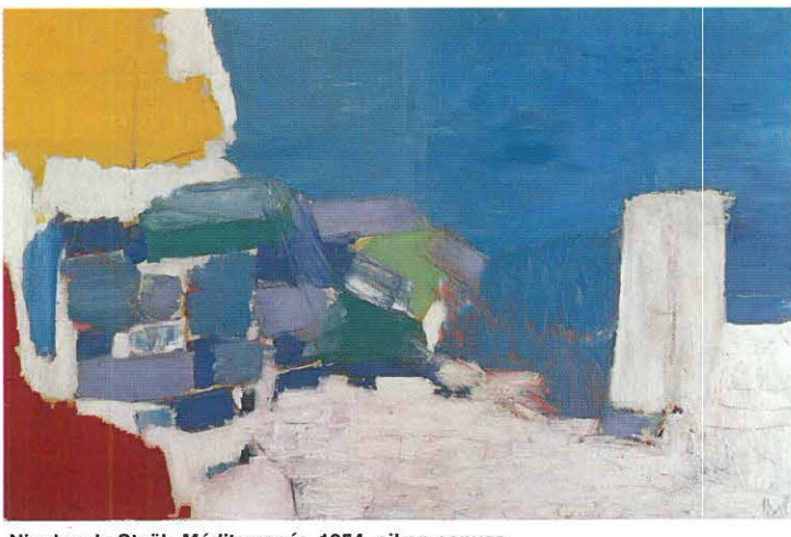
Nicolas de Staël: Méditerranée , 1954, oil on canvas, 37% by 57% inches; at Mitchell-Innes & Nash.