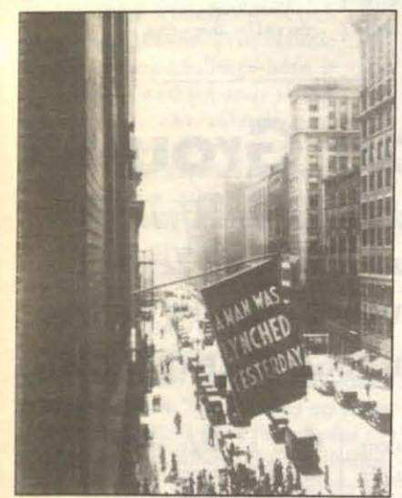
Top: Robert Minor, The Southern Gentleman Demonstrates his Superiority, 1915, cover from The Masses, at The Jewish Museum San Francisco. Bottom: A Man Was Lynched Yesterday, photograph depicting a banner that was hung from the window of the NAACP's New York office.

and social activism. The history of the temple, renovated and reclaimed by African Americans after Jews abandoned the city for the suburbs, iterates the tensions between the groups, as well; as American Jews prospered economically and assimilated socially, African Americans of all classes confronted seemingly impenetrable barriers. Joshua at Jericho, a striking collage by Romare Bearden, also uses religious imagery to evoke the